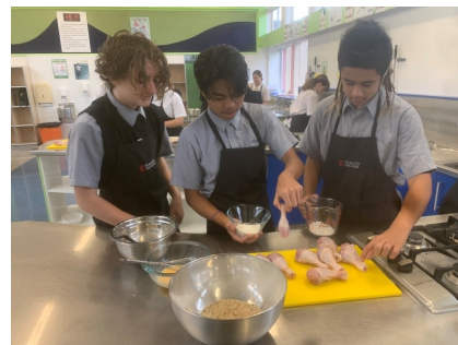
Food and Nutrition—Senior and Junior classes at work.

Five of our Year 10 and 11 students have been participating in an 8 Week Hauora Challenge. They have been learning about nutrition, exercise, goal setting and looking after their hauora. Each morning they have been heading over to Flex Fitness for a workout. They have been working hard and have gained 16 credits through the programme so far. Thank you to Higgins who have funded the cost of gym memberships for these students.