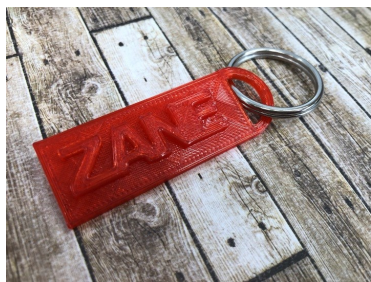
3D printing — cool learning for our students